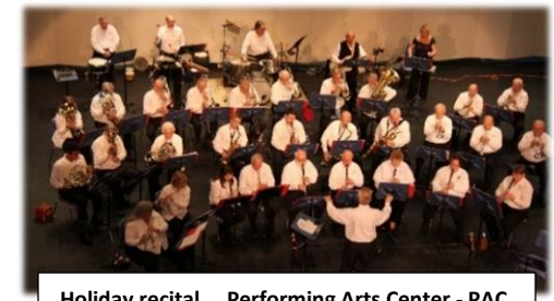
Holiday recital ... Performing Arts Center - PAC