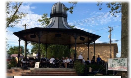
Summer concert at Cape May Rotary Park

The Premier Community Concert Band of Cape May County!