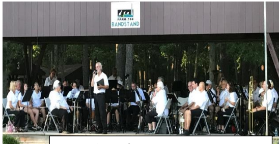
An evening at the Cape May County Zoo

The John Walter Band entertains at both private and public venues year-round, performing selections that are sure to appeal to audiences of all ages. Public concerts are free and all venues are handicap accessible.